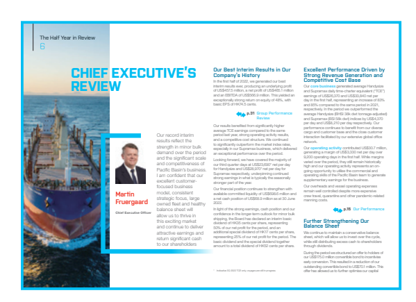
Chief Executive's Review